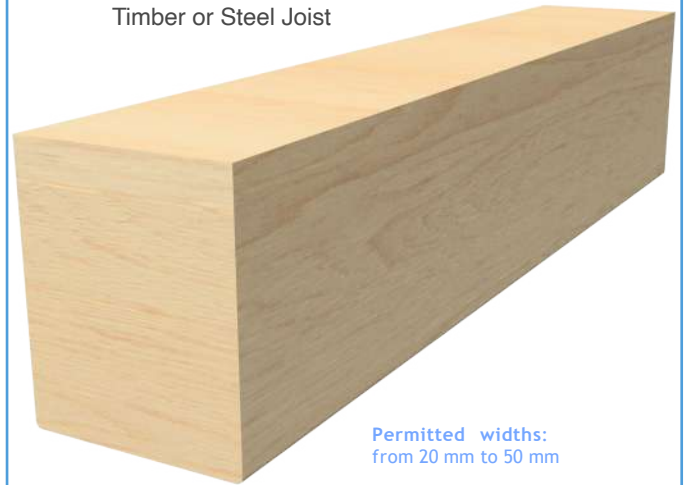
RASTREL Timber or Steel Joist

*System registered with the Spanish Patent and Trademark Office.