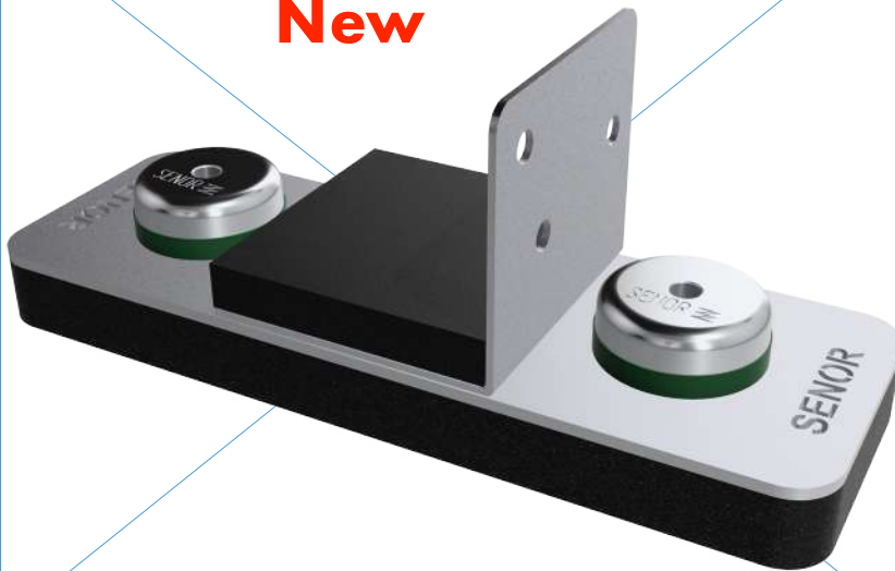
FIELD OF APPLICATION Technical floor with impact of noise